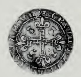
Lot No. 2918

SCOTLAND. King James V, 1526-1539. Gold Crown, n.d. Type II. Obv. Crowned Arms. Rv. Cross fleury with thistles in the angles. Inscription CRVCIS ARMA SEQVAMVR. S.5369. Very Fine. Rare. (1,250-1,500)